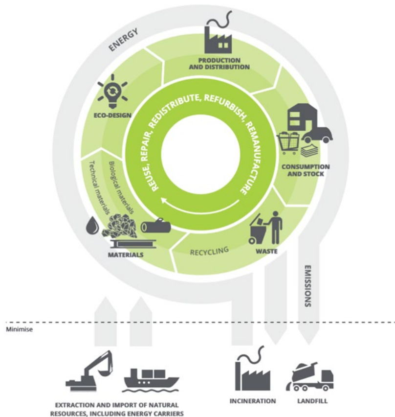
Image 18.1: A Simplified Model of the Circular Economy for Materials and Energy (European Environment Agency (EEA) 2016)

The principal objective of sustainable resource and waste management is to use resources more efficiently, where the value of products, material and resources is maintained in the economy for as long as possible such that the generation of waste is minimised. To achieve resource efficiency there is a need to move from a traditional linear economy to a circular economy (refer to Image 18.1).